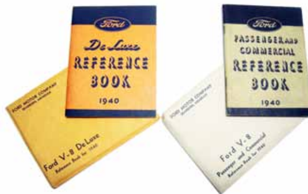
Deluxe and Ford V-8 reference books

All manuals included both a 300 and 1000 mile free inspection coupon on the last page. This page was perforated to aid in the removal of the coupons; the easiest way to differentiate between an authentic manual and a reprinted version.