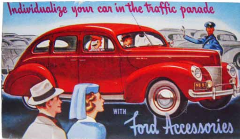
Accessory brochure cover

While branch plants were specifically instructed to place an accessory brochure within each vehicle in 1939, your author was unable to determine whether or not this policy continued for the 1940 model year.