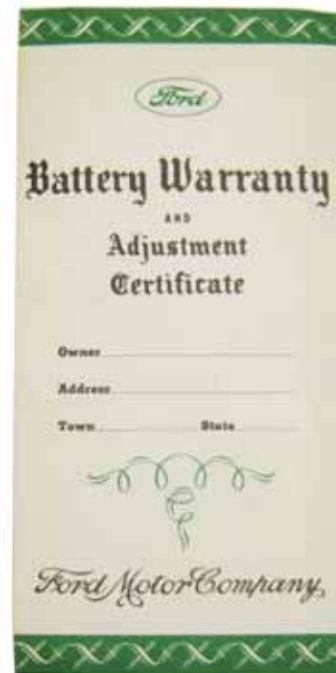
Battery warranty and adjustment certificate

Form number 7200 was intended to be partially filled out by the dealer upon delivery of the new vehicle.