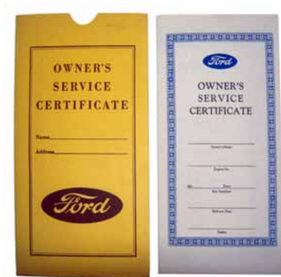
Owner's service certificate with envelope

This tri-fold certificate was printed on white paper in blue and black ink. Folded, it measured approximately 3 5/8" x 7". Form number 7130 was intended to be filled out by the dealer at the time of delivery and subsequently placed within a yellow sleeve (envelope) with brown printing on it. The owners name, engine number, key numbers, delivery date and the dealer's name were filled in on the front page. Unfolded was the context of the certificate, describing the lubrication and maintenance services provided free of charge for the first year of operation. On the back was a chart that was used to record the dates when these services were in fact performed.